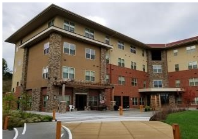
St. Michael's Homes for Veterans