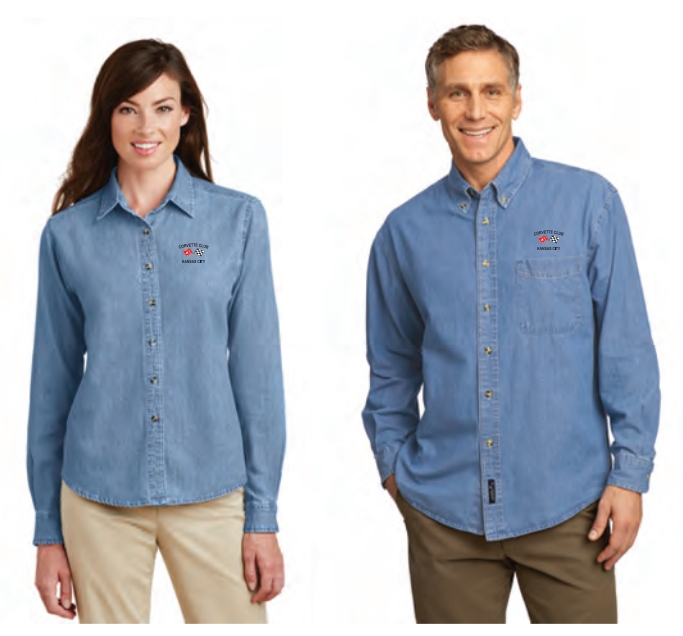
Shirt Color: Faded Blue (7)